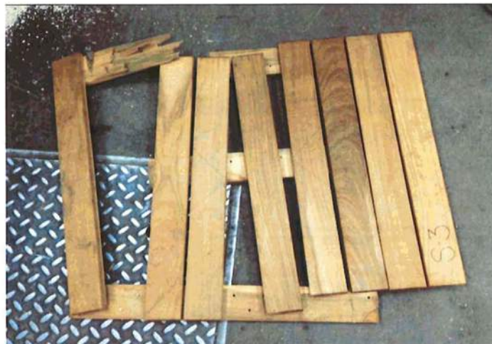
Photo No.2 Typical Failed Sample

\\SECO1\new_e\PHYLAB\2015\43208 TileTech\job1\report\L-15-1916 IPE Wood Tile Load Tests