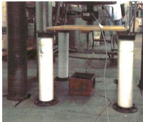
Photo No.1 General Test Setup